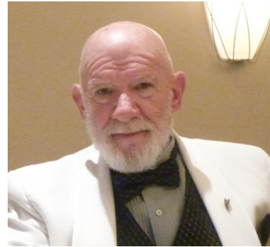
From the Supreme Secretary's Desk

Once again I ask, if you submit an article for publication in Pythian International, please send a digital (not newspaper) photo; conversely, if you send a photo, please send an accompanying article. One without the other does not make for an interesting article.