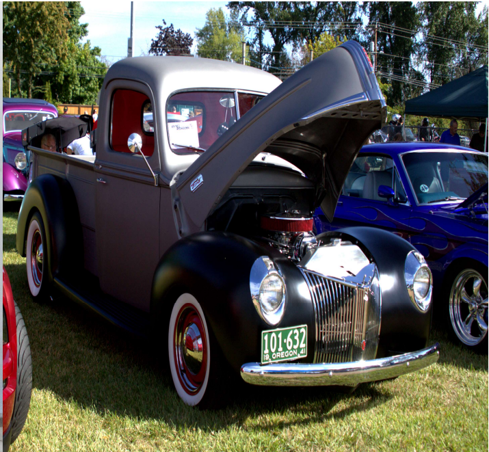
Wapato Car Show Winner 1941 Ford Pickup