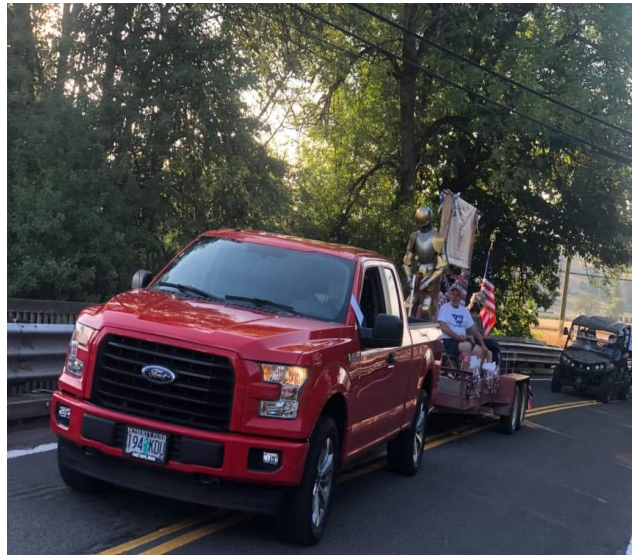
Grand Lodge float