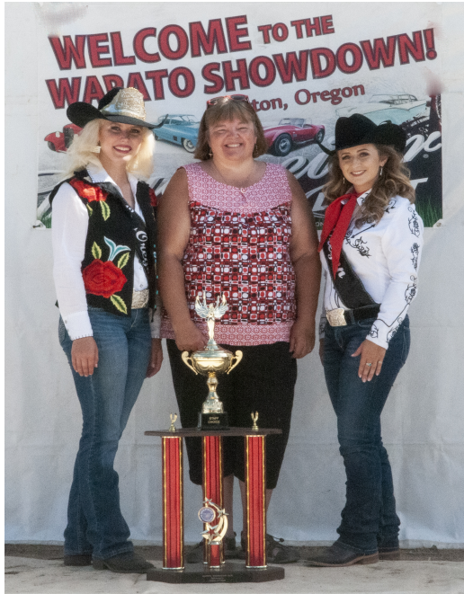
Miss Rodeo Oregon 2019 and 2020