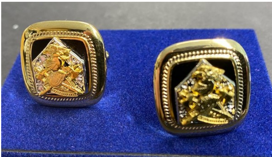
#465KPC Onyx Cufflinks Regular Retail $23.50 on sale for $12.00