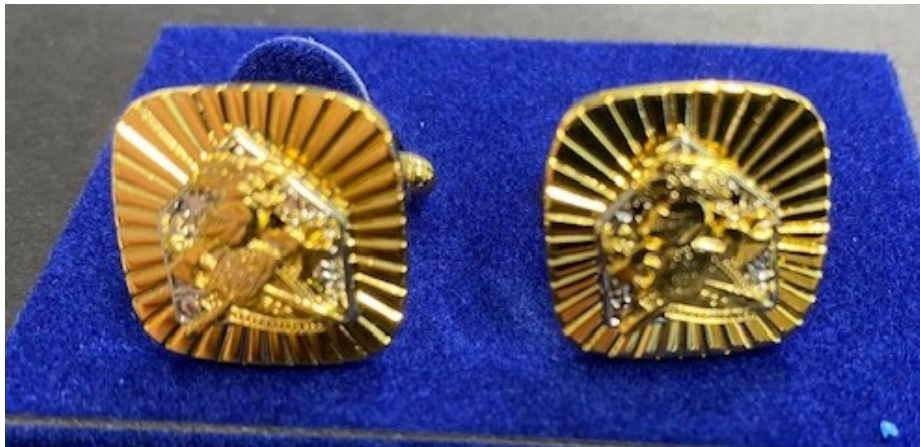
#7032KPC Regular Retail $17.00 on sale for $8.00