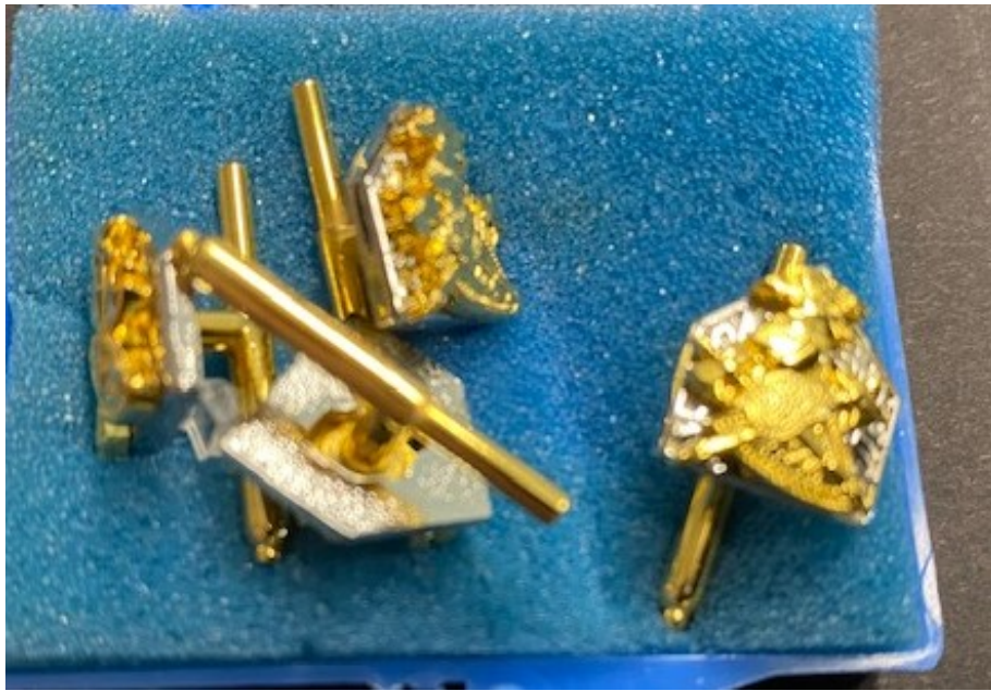
#151KPC (shirt Studs) Regular Retail $31.25 set of four (4) on sale for $15.00