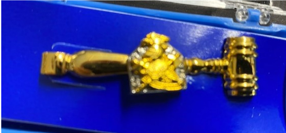
#772K Regular Retail $12.00 on sale for $6.00