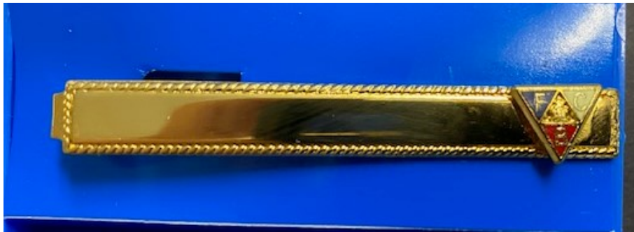
#6036K Regular Retail $12.00 on sale for $6.00

Please order by the catalog number. Again, once they're gone, they're gone.