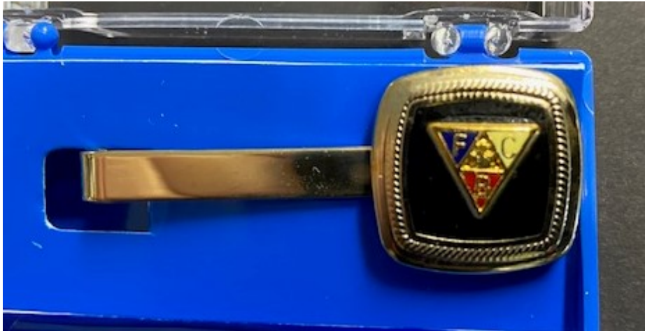
#463K Onyx Regular Retail $11.00 on sale for $5.00