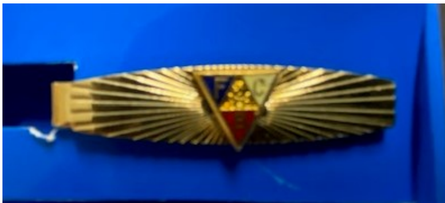
#7038K Regular Retail $10.00 on sale for $5.00