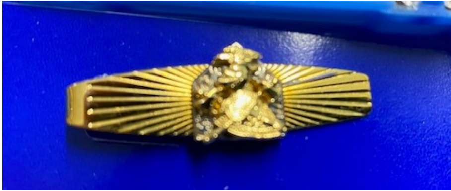
#7038KPC Regular Retail $12.00 on sale for $6.00