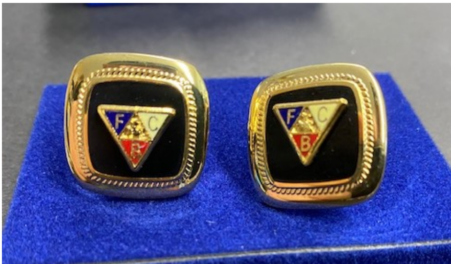
#465K Onyx Cufflinks Regular Retail $20.25 on sale for $10.00