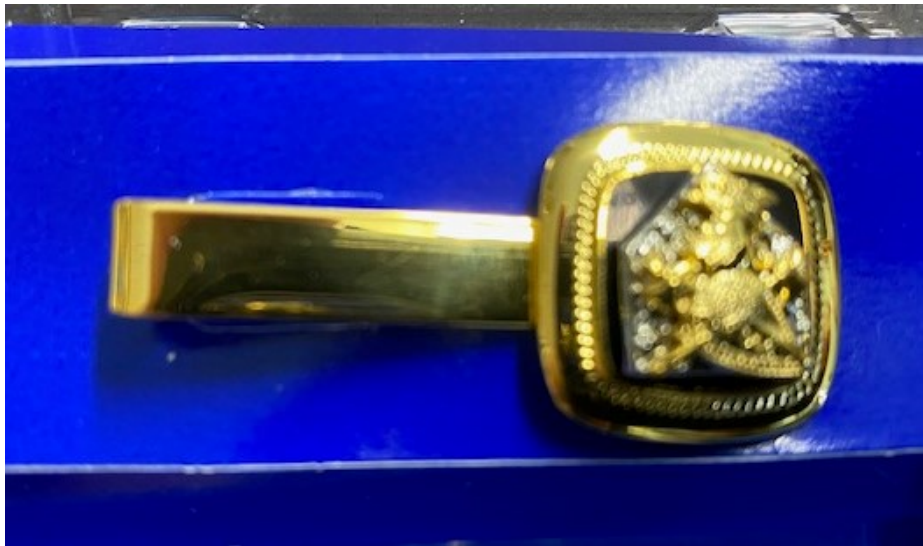
#463KPC Regular Retail $12.50 on sale for $6.00