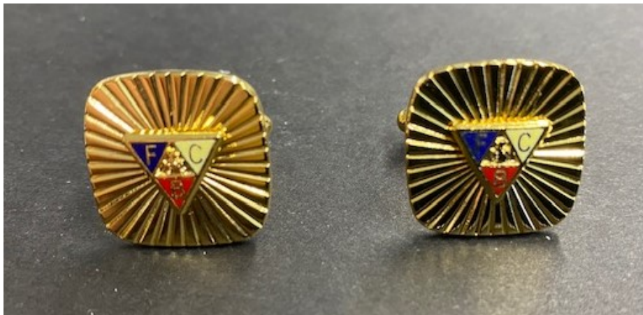
#7032K Regular Retail $15.50 on sale for $8.00