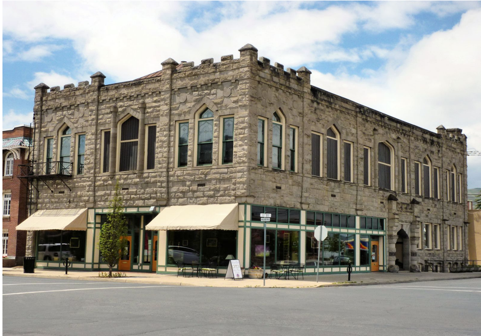
Baker City, Oregon Pythian Castle