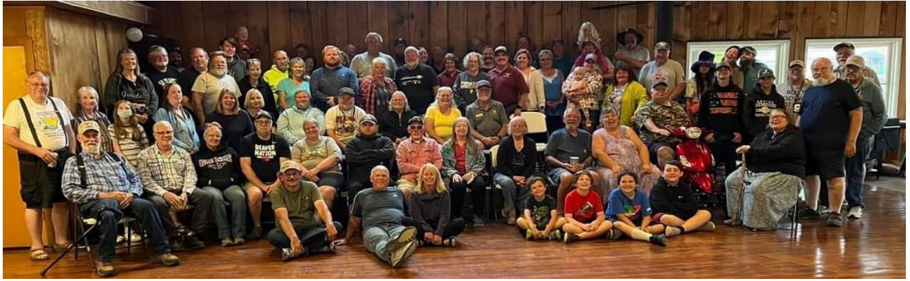
FFUN-DAY 2022 GROUP PICTURE