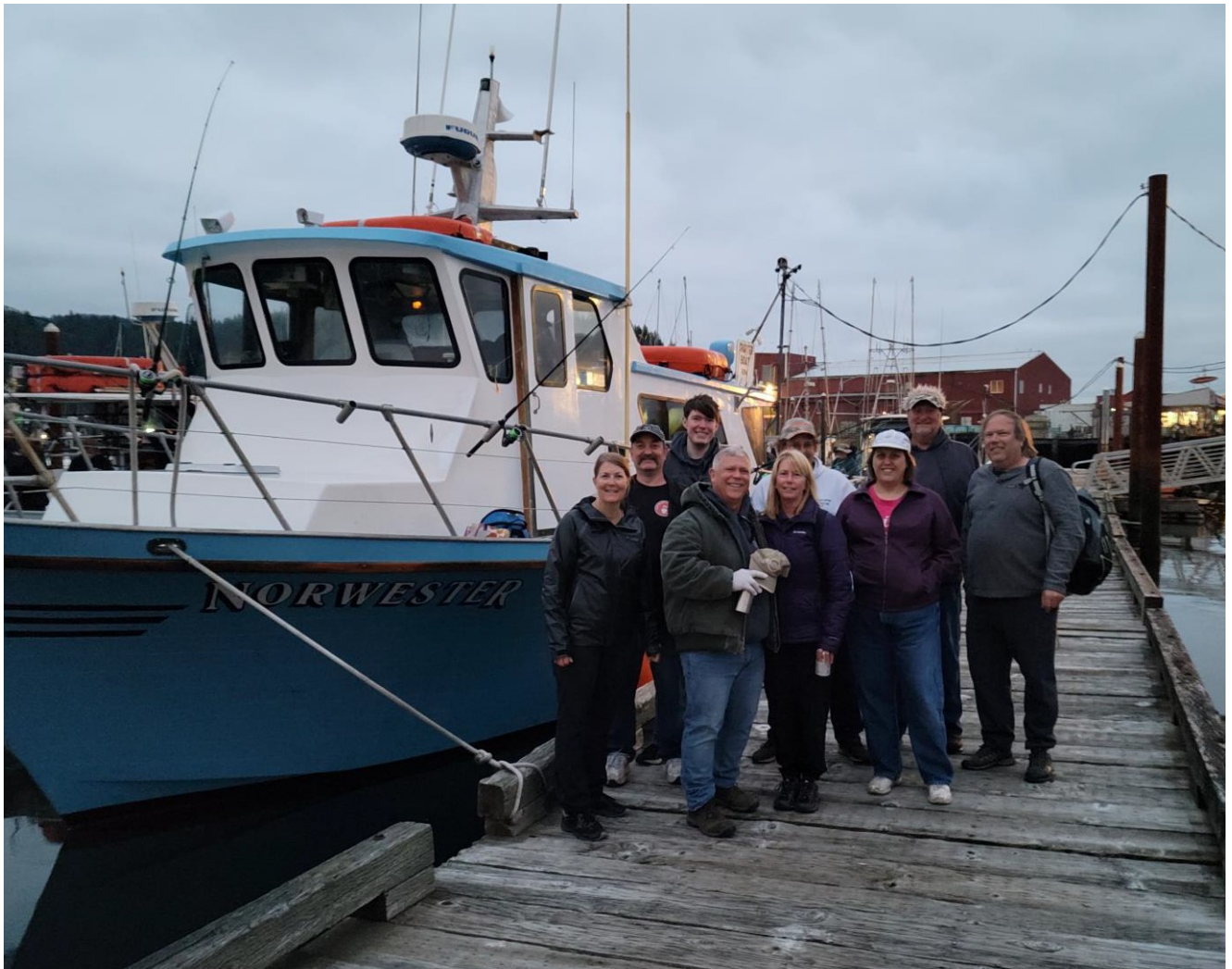
FFUN-DAY OF FISHING