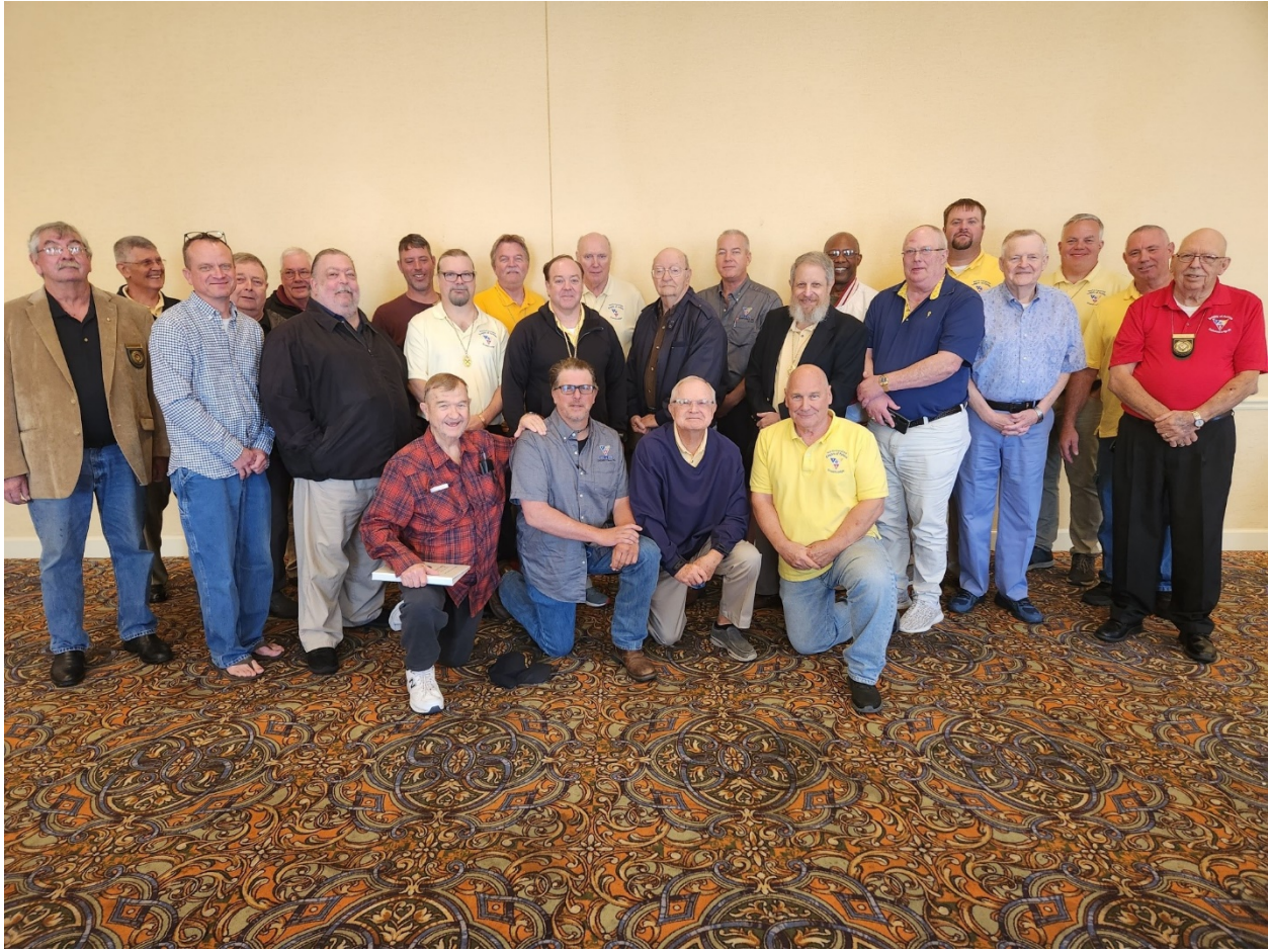
The Convention was held in Myrtle Beach, SC at the Kingston Plantation Resort September 30 and October 1.