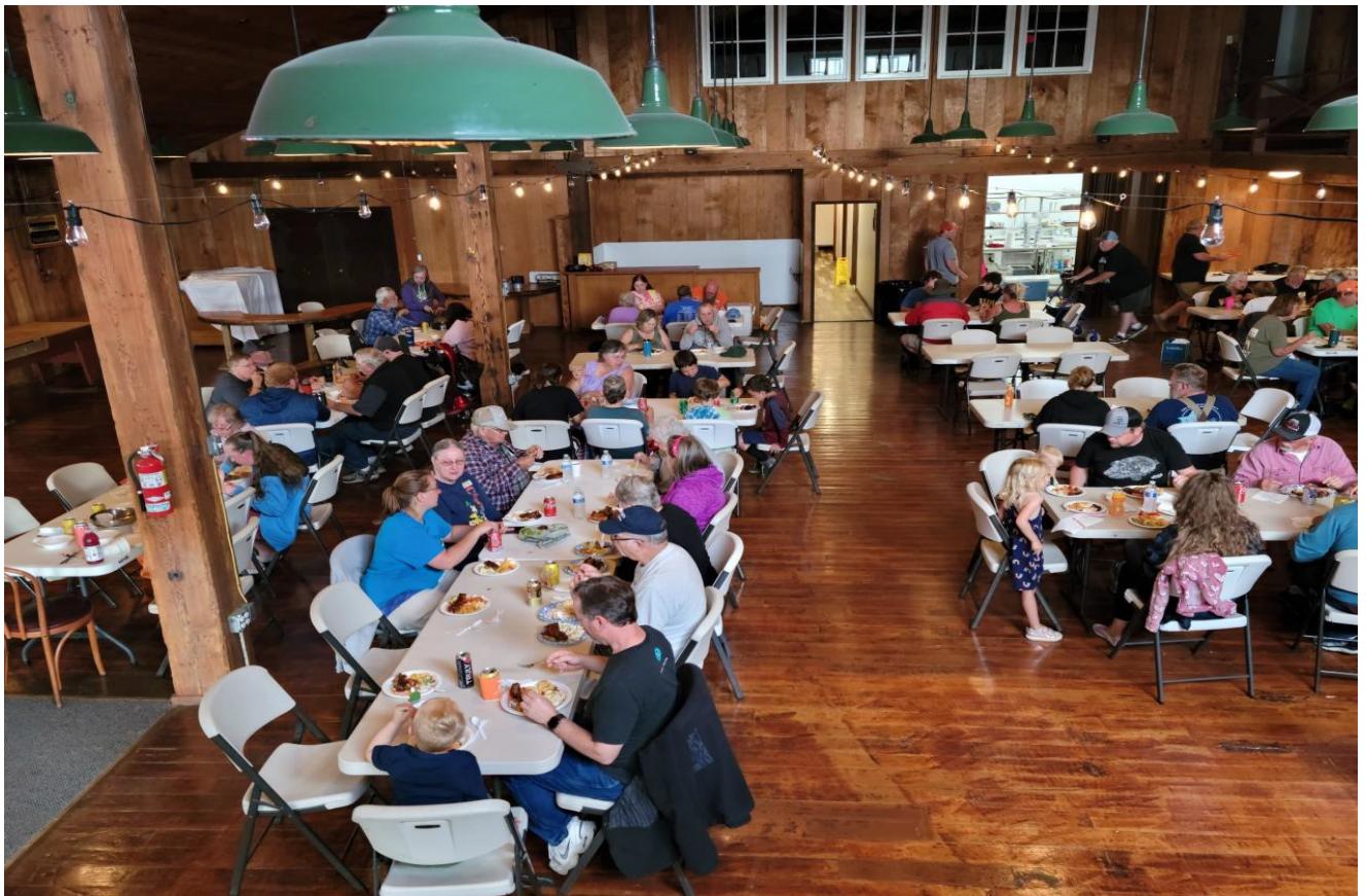
DINNER AND FELLOWSHIP

On Sunday morning, Grand Lodge officers prepared breakfast for all the participants before heading home.