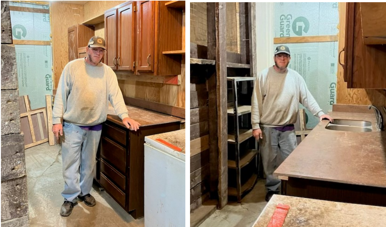
Danville, VT Lodge helping to build a kitchen in a habitat for humanity.