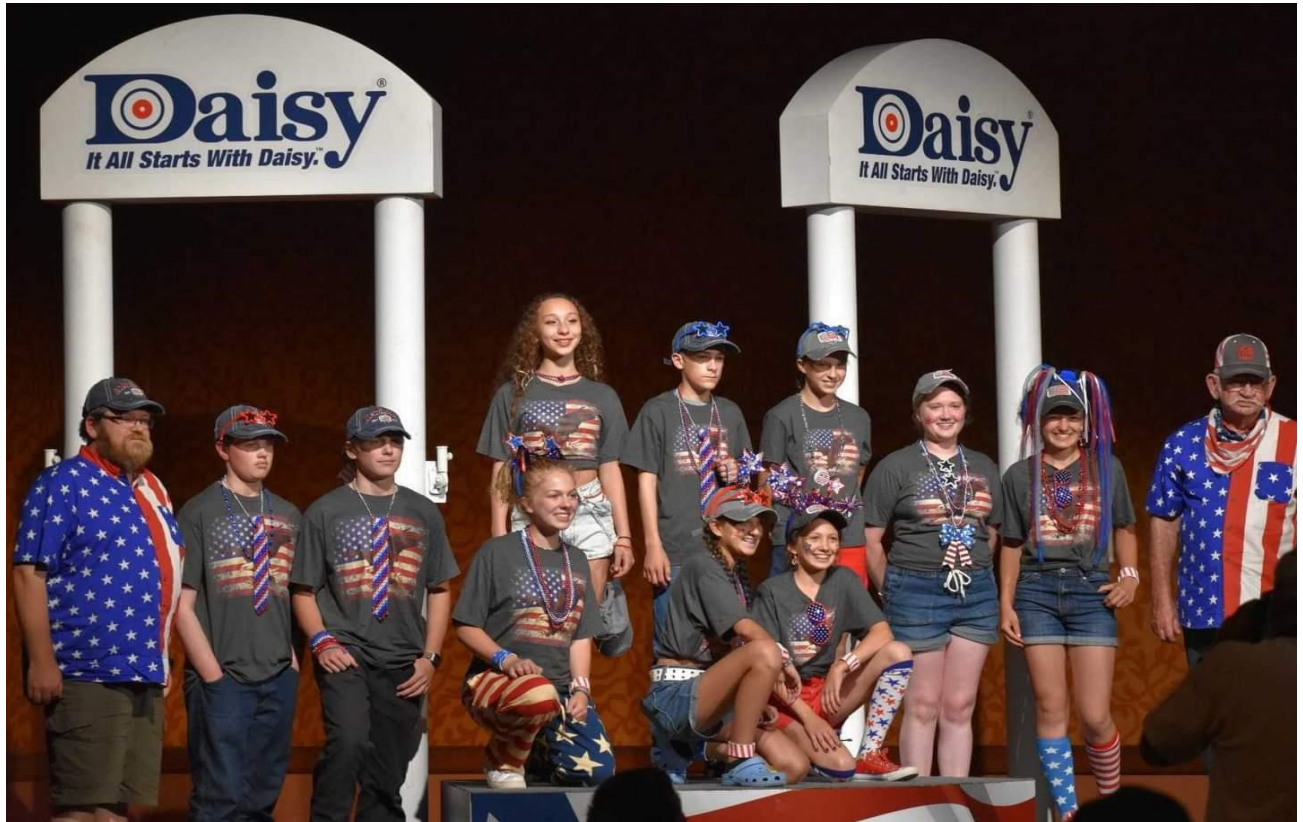
Timber Beast's 2023 Team and Coaches