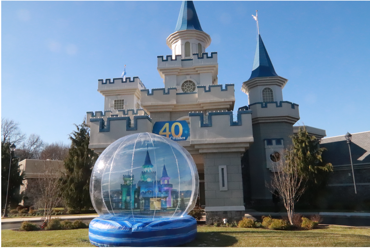
Photo of the 40 th Anniversary Celebration at the Make-A-Wish “Wishing Castle,” where the Magic Happens to children of all ages in need of that one last wish to forget their daily medical and physical struggles and give them that special day.