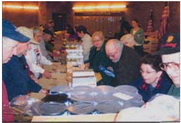
Brothers of Rochester Jay Lodge packed hundreds of baskets for Rochester's neediest families during the holiday season.