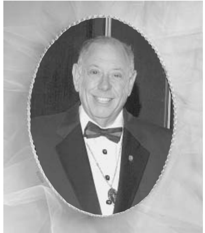
SIR JERRY SILVER