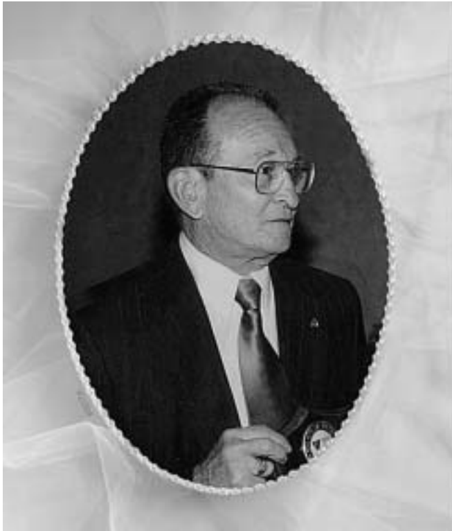
SIR WILLIAM DOYLE FINLEY