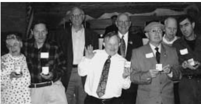
The presenters and the receivers of the Honor An Athlete Coins

The athletes were especially chosen for outstanding levels of dedication, determination, true sportsmanship with help to their teammates, attitude, achievement and personal growth.